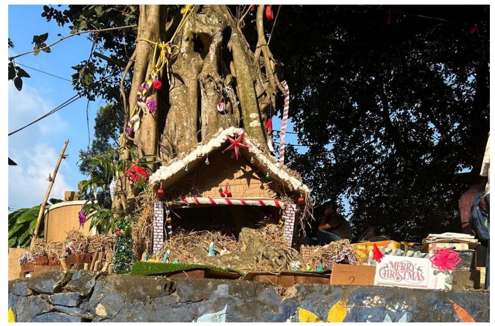
CRIB MAKING CONTEST FOR STUDENTS AS PART OF CHRISTMAS CELEBRATION