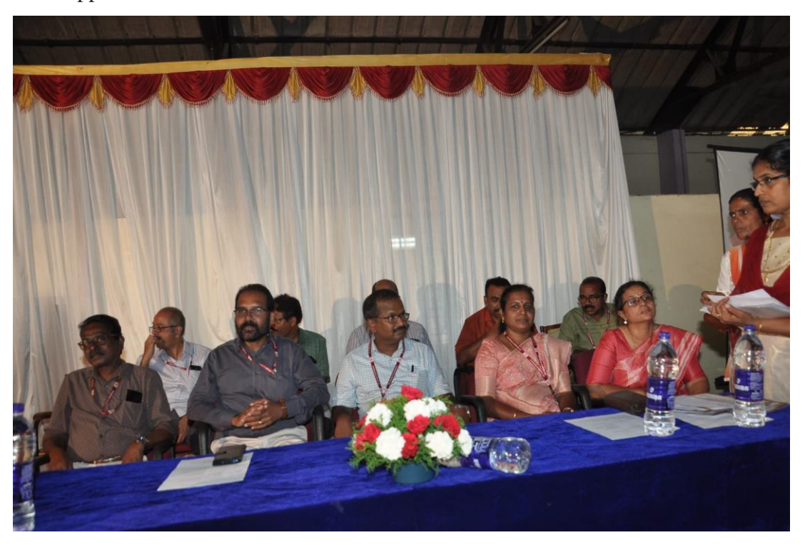
A GLIMPSE OF FIRST YEAR INDUCTION PROGRAM

The toppers of 2023 batch were felicitated in this function.