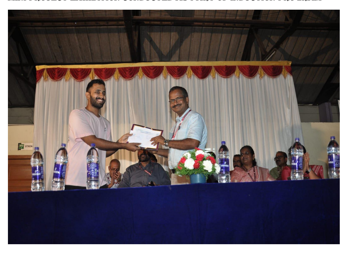
PRINCIPAL FELICITATING 2023 BATCH TOPPERS