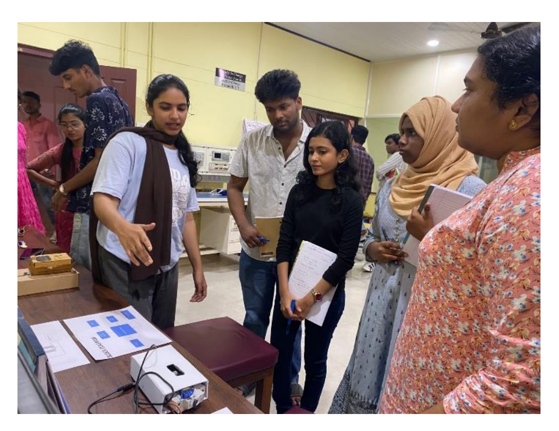
MINI PROJECT EXHIBITION CONDUCTED AS PART OF INDUCTION PROGRAM