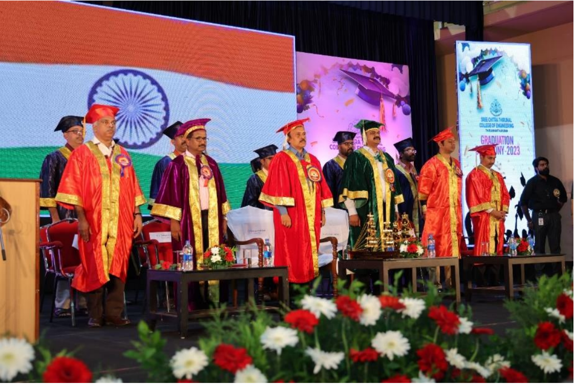
GLIMPSE OF GRADUATION CEREMONY-2023