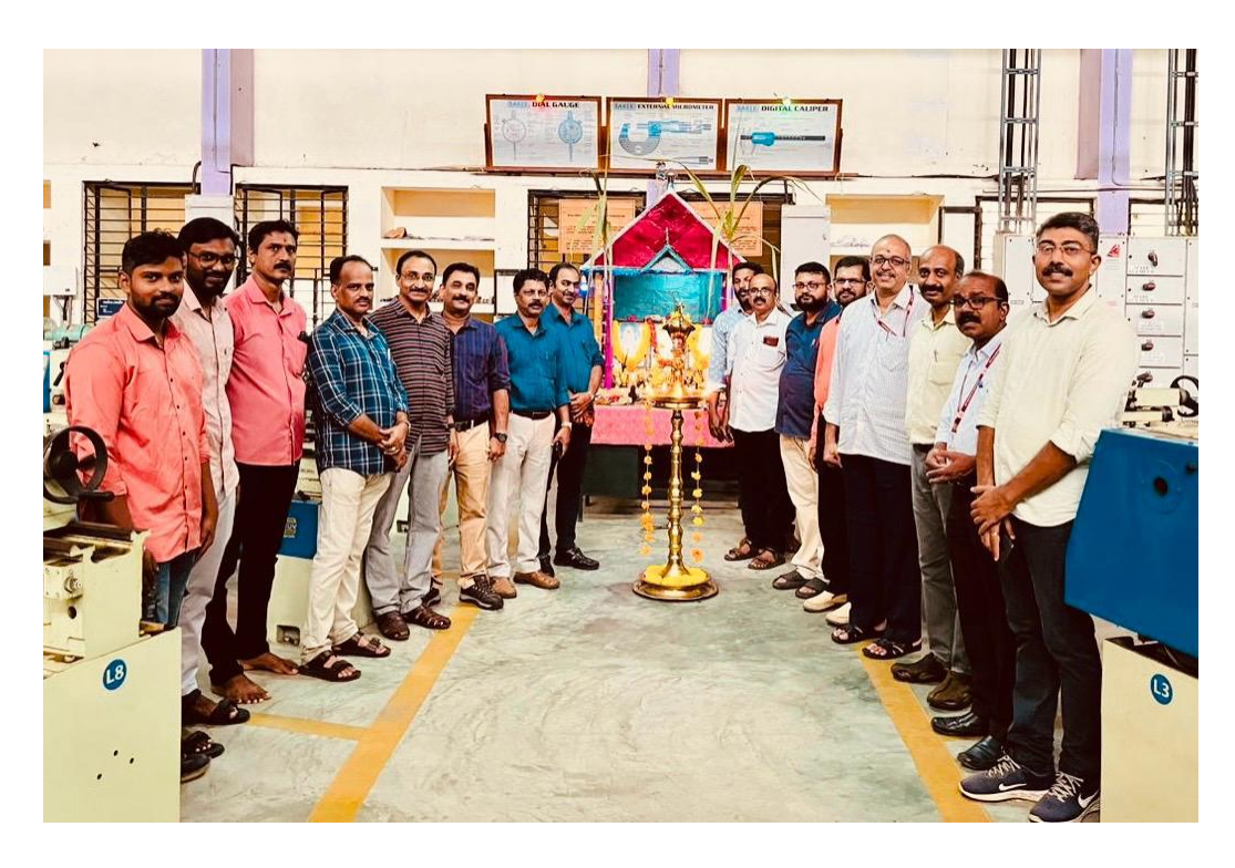
NAVARATHRI POOJA CELEBRATION