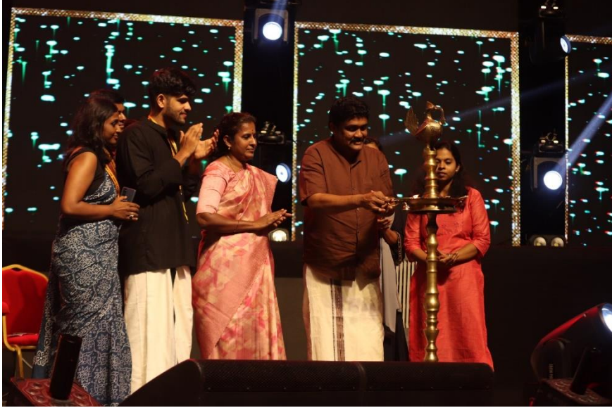
CULT-A-WAY 2023 INAUGURATION